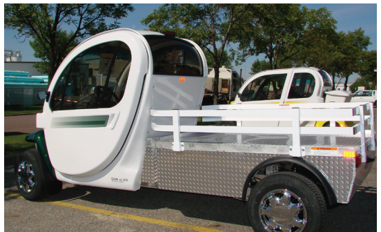
Hard Doors, Stake-Back Kits